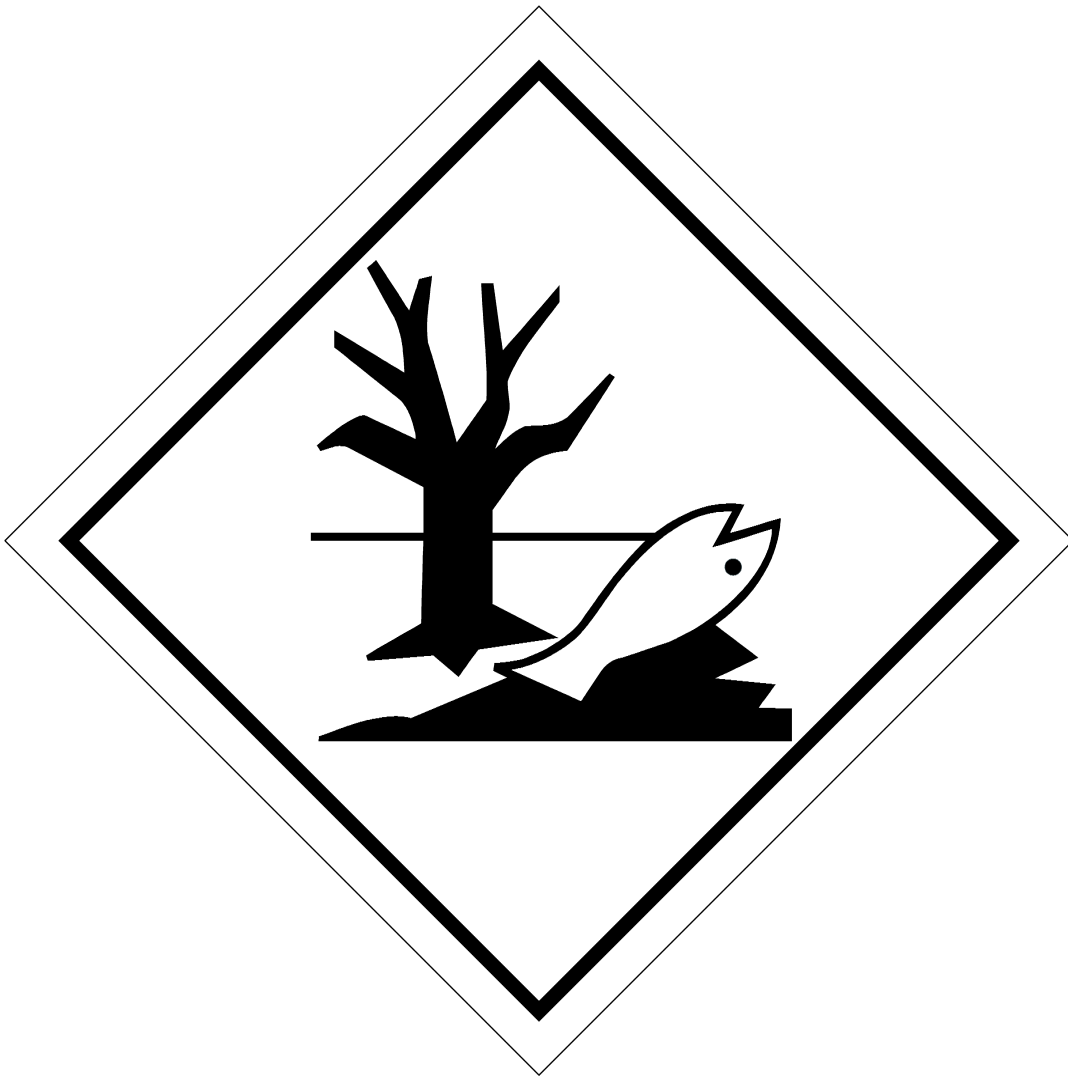
Non-Bordered Black Diamond Holder