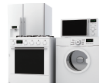
⊙ White Appliances