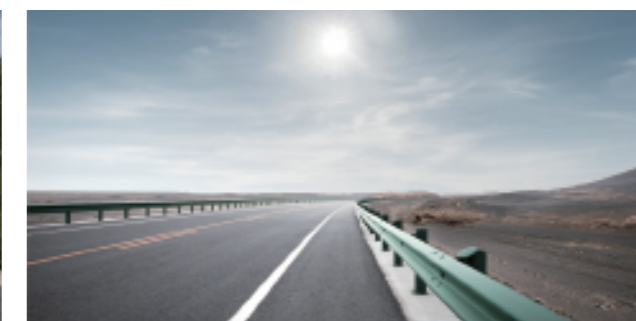
◎ Highway Guardrail