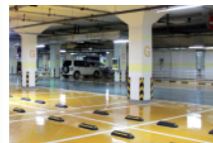
⊙ Floor Paintings