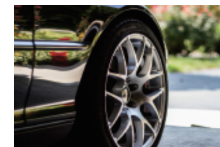
⊙ Automobile Hub