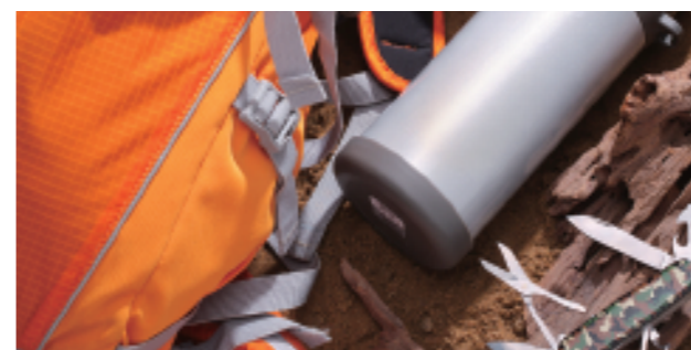
◎ Outdoor Leisure