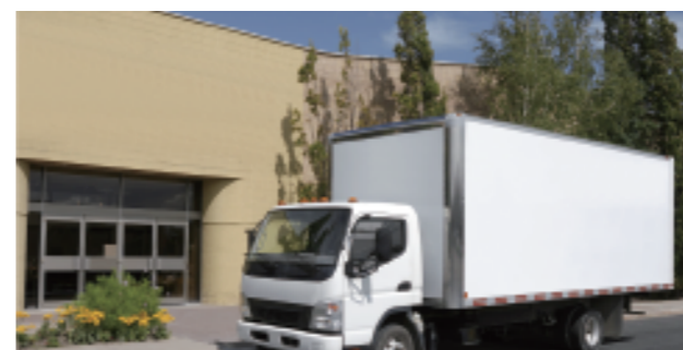
◎ Vehicle Box

Six months under normal temperature of 25℃, the product can also be used after passing the inspection if beyond the shelf period.